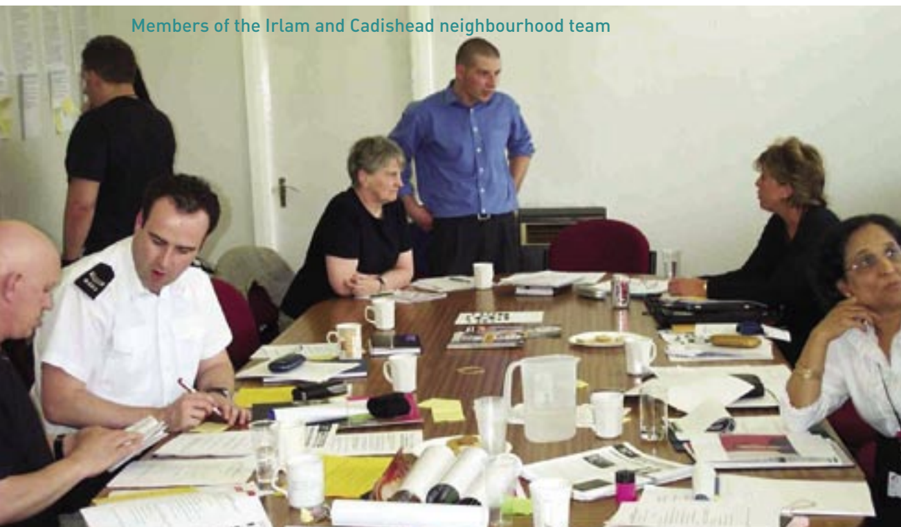
Members of the Irlam and Cadishead neighbourhood team

Each issue we'll feature a different neighbourhood team. In the meantime, for further information about the other seven neighbourhoods, contact: